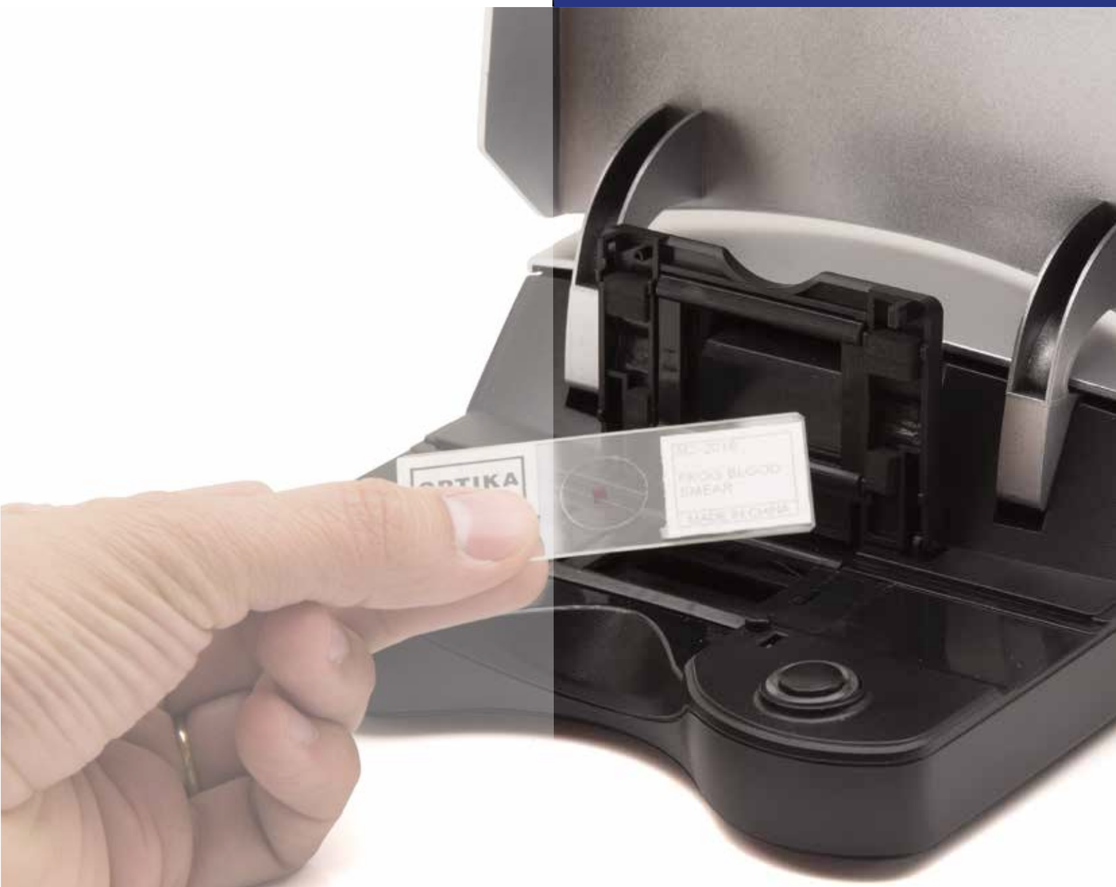
OPTISCAN10 Digital scanner